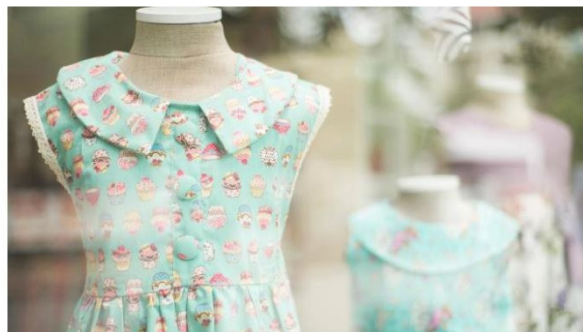
The seven-year-old boy, who was home-schooled, was dressed in girls' clothes

October 8 2017, 12:01am, The Sunday Times